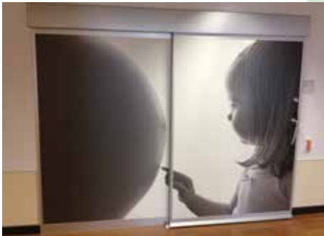
Hermetically airtight automatic door record CLEAN K1-A

The record program provides a wide range of automatic doors and peripherals for every conceivable application. Core products are linear and radial automatic sliding doors, swing door drives, folding doors, revolving doors, burglar-resistant doors, security doors for use in escape and rescue routes as well as for fire protection. There are also special products such as doors for hygienically demanding applications, airtight doors, high-speed doors and one-way access systems.